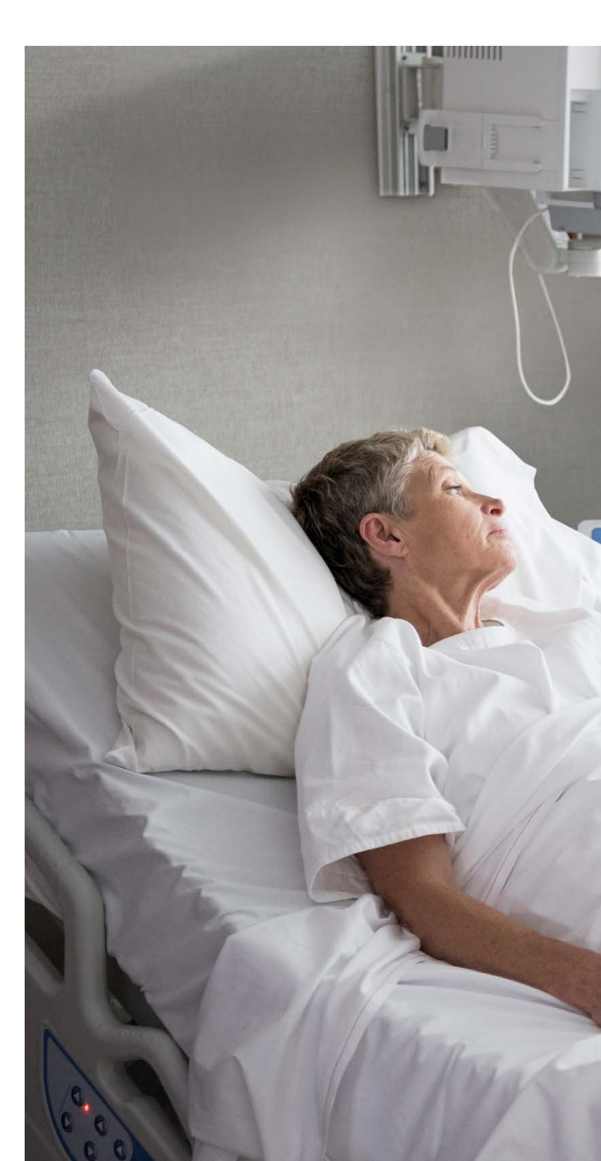
Photo Panels has been developed as a professional helping tool to stimulate people in different situations by creating peace and calm, security and protection or memories of recognizable places. They offer at the same time optimal hygiene and privacy without feeling closed in.

Natural motifs with depth and perspective create a sense of calm.